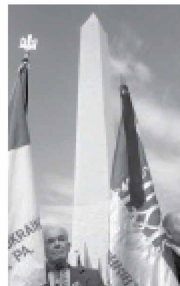
Holodomor Commemoration Washington DC, 1983

UKRAINIAN CHURCHES across the United States tell a story that is both Ukrainian and American. Hundreds of Catholic, Evangelical, Orthodox, and other parishes testify to the large number of Ukrainians in America, over one-million according to the 2020 census. The photographer visited more than 90 churches to document not so much their architecture but their context in America — the signage, flags, construction material or location in a commercial, industrial, residential or rural neighborhood. Several Ukrainian churches stand next to shrines of other ethnicities or denominations, each telling the same American story of freedom to speak, to assemble and to pray.