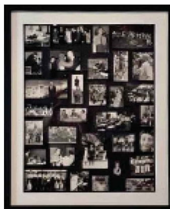
Triptych, Middle Panel

A TOUCHSCREEN DISPLAY at the Lakewood Public Library features Fedynsky photographs, which document 38 years of life in the Ukrainian-American community. The image pay tribute not only to Ukrainians, their culture and friends, but also to the United States, which welcomed them to pursue freedoms often denied in their ancestral homeland. 5,300+ pictures depict people playing, praying, protesting and just being themselves. Visitors can select any of 2,137 names on a touchscreen and see pictures associated with that individual. Pictures are also grouped by categories such as siblings, clergy, musicians, flags, embroideries, activism, and gags.