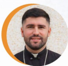
о. Остап Мукитшин Філадельфійська Архиепархія УГКЦ